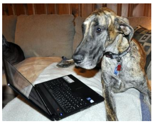
On the other hand, RIVA may have some misgivings... "Working from home has got to stop! My humans are driving me nuts!" Sounds like her family needs to check the list above.