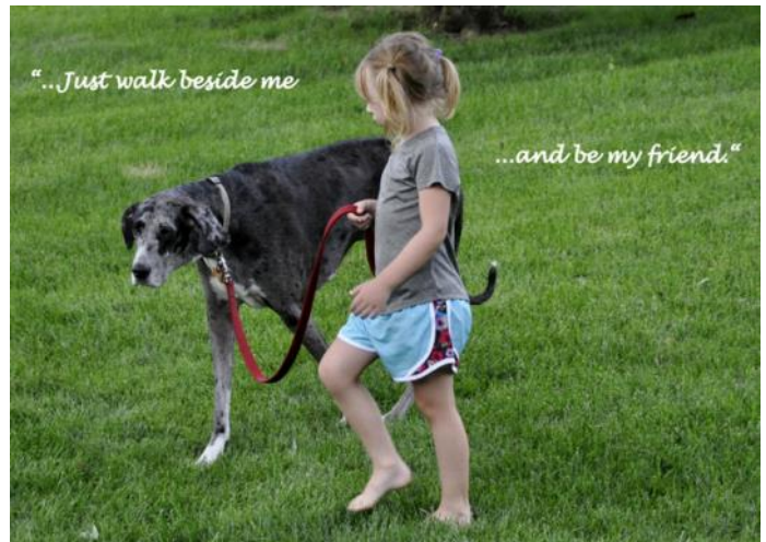
NADIA, past HHGDR Sanctuary Dane, and young friend.

More information on the study from Uppsala University.