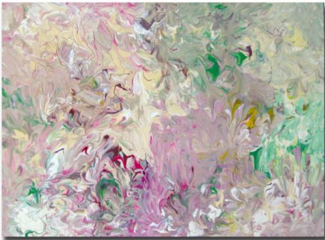
Mo's Memories of Mom by MOZART DANE. 18" x 24" acrylic on canvas, $275.

HHGDR continues to honor Mo by taking up his quest to end the abuse and neglect of dogs and puppies in puppy mills. The Mozart Dane Facebook page and Twitter account have