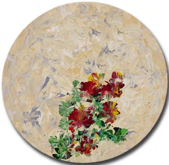
Iris's in the Mo-rning by MOZART. 16" round, acrylic on canvas, $175.

MOZART paints with his paws to help support the Rescue and provide for the homeless dogs. He is the Rescue Spokesdog against puppy mills, pet stores, and for spay/neuter.