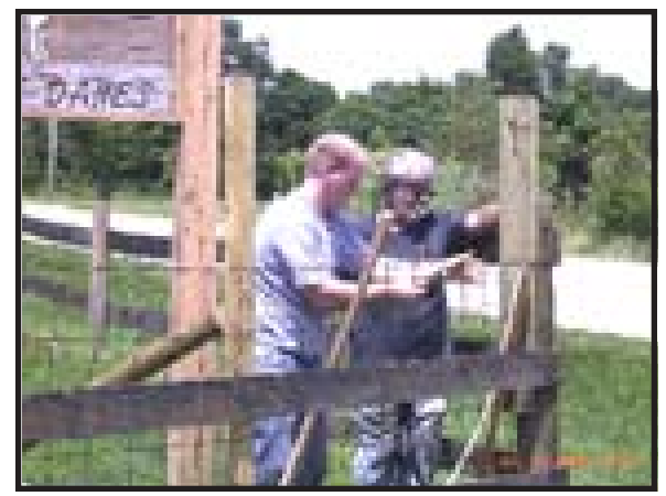
Measure twice, cut once!

Thanks to the volunteers who have donated time and muscle to work on the fence.