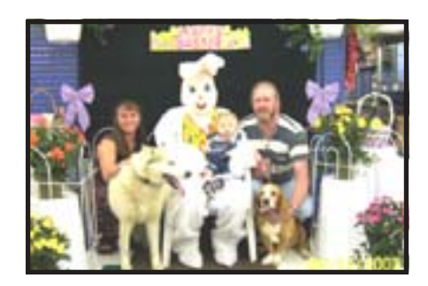
Family Portrait With the Easter Bunny

HHGDSBR volunteers made some folks very happy and made