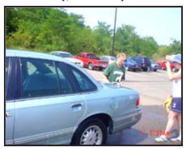
Car Wash, August II, 2002