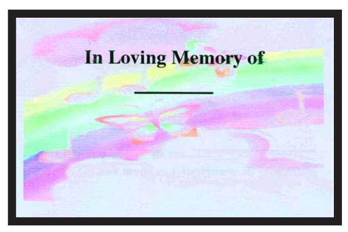
Inside will be a suitable message of condolence for you to send to the family.

The front of the card will vary according to the type of gift or remembrance specified by you. Inside: A picture of your dog and his or her story with a message appropriate for the type of gift