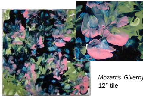
Mozart's Giverny , 12" tile