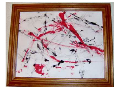
Cautionary Tail , by Christine, tempera on paper, 11" x 14"

For more about Christine see http://www.hhdane.com/danes/christine06.htm