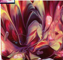
Detail, Paw Blossoms Eight , 4" tile set

Paw Blossoms are unique decorative objects and should not be subjected to high heat.