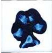
Detail, Paw Blossoms Four , 4" tile set

To create Paw Blossoms Great Dane artist Mozart uses his paws to paint with acrylic paint on ceramic tiles.