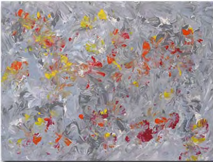
Op-Paw-tunity Knocks by MOZART. 12" x 16" acrylic on canvas, $155.

MOZART has retired from painting and exhibiting at festivals but still has many lovely art works to offer. Paintings can make a wonderful and unique gift for all animal-lovers.