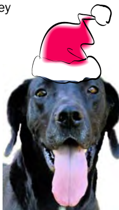
POPPY had Lyme disease when she came to Rescue.

Please see page 2 for our toy wish list!