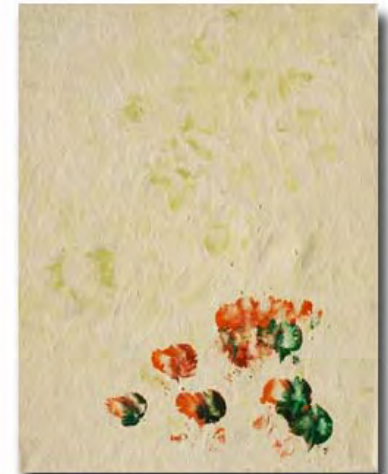
Paw-tersweet Vine by MOZART DANE. 11X14", acrylic on canvas. $110.

With holidays fast approaching, what better time than this to add a unique MOZART painting to your collection or give one as a gift to someone special. Once they are gone, there will be no more.