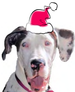
ROSALEE is sight impaired, but that doesn't hold her back.