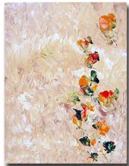
Mozart's Buttercups by MOZART. 11 x 14", acrylic on canvas, $140