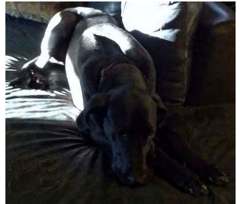
PASHA takes a break from play with her sisters.

This piece could go on forever, considering how happy we are with her, but instead, I will simply say thank you Harlequin Haven for giving this household a