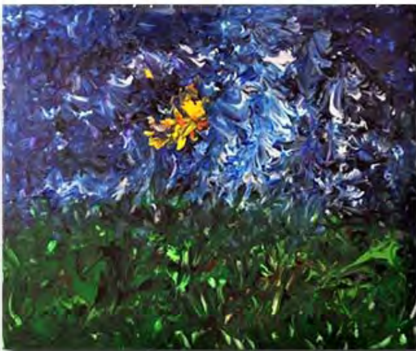
Paw-s by the Lake by MOZART. 20 x 24", acrylic on canvas, $200.

MOZART paints with his paws to help support the Rescue and provide for the homeless dogs. He is the Rescue Spokesdog against puppy mills, pet stores, and for spay/neuter.