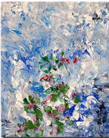
Red Hum-Mo-ngbird Vine by MOZART. 8 x 10", acrylic on canvas, $55