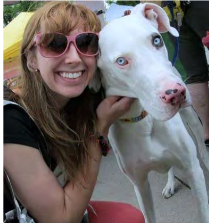
JEREMIAH poses with a fan at the Old West End Festival.

In the days following his adoption, we slowly introduced our handsome boy to our friends and neighbors. Some he took to immediately, and others he growled at and hung back. We consulted a dog behaviorist who came to our home and worked with the three of us. He recommended giving treats to those people JEREMIAH was reluctant to meet.