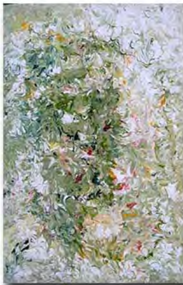
Pure Paw-ssion by MOZART. 24 x 36", acrylic on canvas, $400