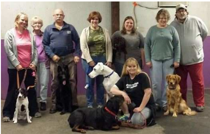
CGC Class photo

HHGDR is an all-volunteer-run non-profit 501(c)(3). Donations are tax-deductible!