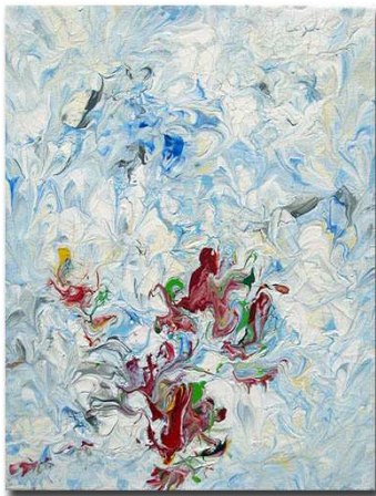
Paw-sonal by MOZART. 11 x 14", acrylic on canvas, $120.