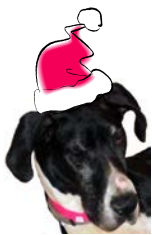
KALEY is a mom and in treatment for heartworm.

Well, another year has passed and yet some of us still have not found forever homes, and others have come to the Rescue from abusive situations, yet we still believe.