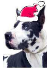
KINGSTON is a Sanctuary Dog.

With today's economy we would also ask that you buy American-made dog toys and maybe we can help put a few people back to work and then more homeless dogs would be adopted! Below are a few links to find American-made dog toys. Of course not all on our list are made in the USA, but we tried!