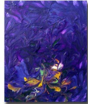
Paw-ple Skies by MOZART DANE. 8 x 10", acrylic on canvas. http://hhdane.org/mozart