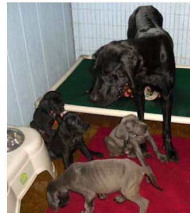
Newly arrived at the Rescue, KALISTA and her pups KAELEN, KYLER, KITRA, and KORINNA with their donated Kuranda bed.

http://hhdane.org/howtohelp/wishlist.htm