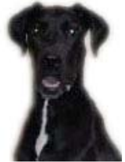
JULIET (and her brother ROMEO) were dumped out on the back roads of Darke County.

http://hhdane.org/howtohelp/howtohelp.htm