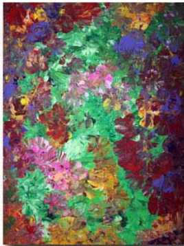
Zami Paw-ow by MOZART DANE. 18 x 24", acrylic on canvas.

HHGDR is an all-volunteer-run nonprofit 501(c)(3). Donations are tax-deductible!