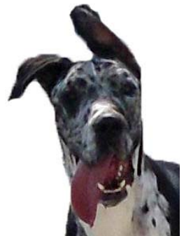
DENVER's breeder was a backyard breeder, then he went to a place that was supposed to be a rescue, but wasn't.

"I used the adult extra-large briefs as they open like a diaper but are bigger and more absorbent than the diapers the company recommends. The diapers they recommend may be fine for a female but the male needed a wider range to fit. I tried Depends brand but the plastic outer protection caused a severe rash. I preferred the store brands as they did not have the outer plastic liner, were just as absorbent, and no rash."