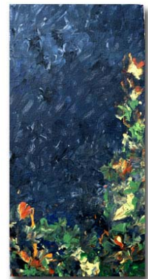
Beyond Paw-adise by MOZART DANE. 16 X 8",

HHGDR is a non-profit 501(c)(3) all-volunteer-run organization. Donations are tax-deductible!