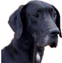
SPRING was found roaming the busy streets of Butler County.

per year, HHGDR will choose a dog for you. A certificate and your choice of a letter and photo, or a special occasion card, will be sent either to you or as a gift to a recipient of your