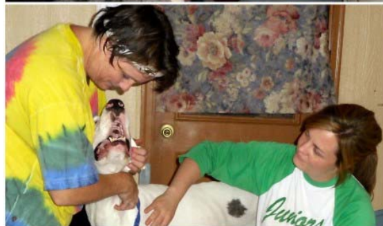
Volunteers converge on the Rescue monthly to deep clean the facility and give the dogs extra grooming and attention.