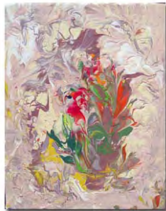
Jack in the Paw-IPit by Mozart. 8 x 10”, acrylic on canvas

Think GREEN when it comes to lawn care and household cleaning this spring, and save your pets from contact with toxic substances. That perfect lawn is probably not worth the chemical exposure to both you and your fur kids.