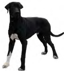
LOGAN is a Mastiff