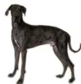
ZACK is a Great Dane

The Harlequin Haven Great Dane Rescue Newsletter is published four times a year by the Rescue.