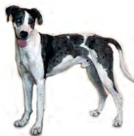
SNEAK is a Dane-Catahoula mix