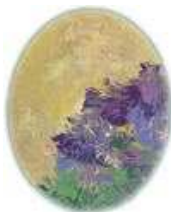
Dane-ced by the Light of the Moon

http://macworthington.com/featuredartist15.htm , and also on the Rescue Web site under the “How to Help” section. And remember all proceeds go to help the dogs!