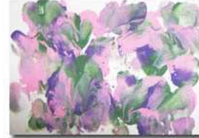
Paw-painted note cards by MOZART are offered on eBay. Blank inside for you to personalize, they make a perfect gift!