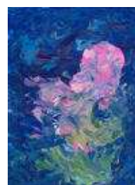
Paws and Reflect