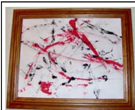
Cautionary Tail by CHRISTINE.

Christine was rescued by Harlequin Haven from the Pickaway County Cruelty Case in which a "hoarder" kept many dogs under terrible conditions. The hoarder had purchased Christine from Petland. Hunte Corp., a puppy mill broker, was Petland's supplier.