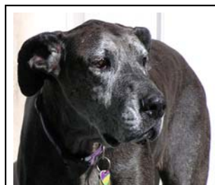
SUCCESS STORY: NIKKI was adopted last summer after living at the Rescue for four years. She continues to do very well in her new forever home with 4 other dogs and 5 cats.