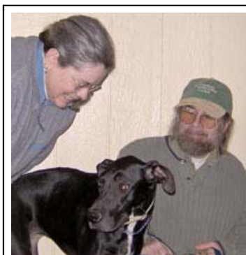
DORI on her adoption day with her new forever family