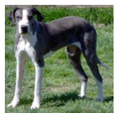
MOZART Dane paw-artist.

From the start some dogs just couldn't stand the feel of the non-toxic finger paint. But others seemed to