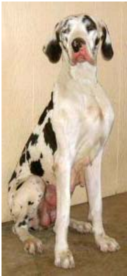
BROOKE is a homeless victim of the Pickaway Co. Cruelty Case.

to contribute to the care and welfare of the homeless dogs.