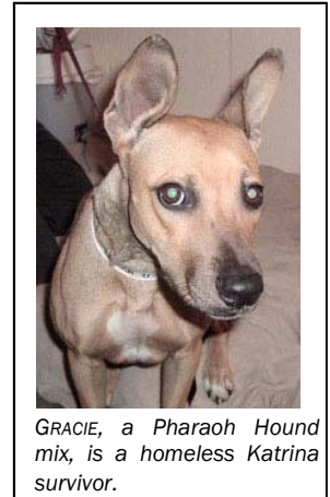
GRACIE, a Pharaoh Hound mix, is a homeless Katrina survivor.