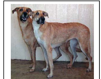
GYPSY & PIXIE, homeless sisters, are Great Dane and German Shepherd Dog mixes.