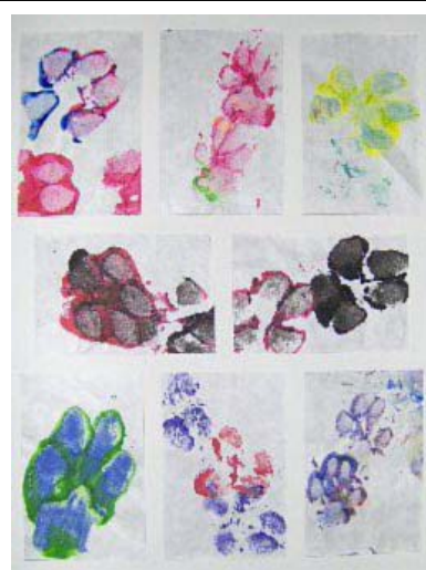
United Pawpose by MOZART and his Puppy Mill Art Therapy Group.

http://www.hhdane.com/howtohelp/ebayauctions.htm