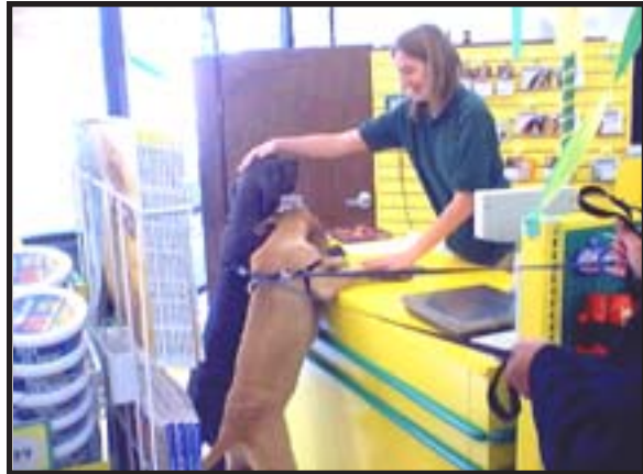
Stella and George Shopping at Pet Supply Plus