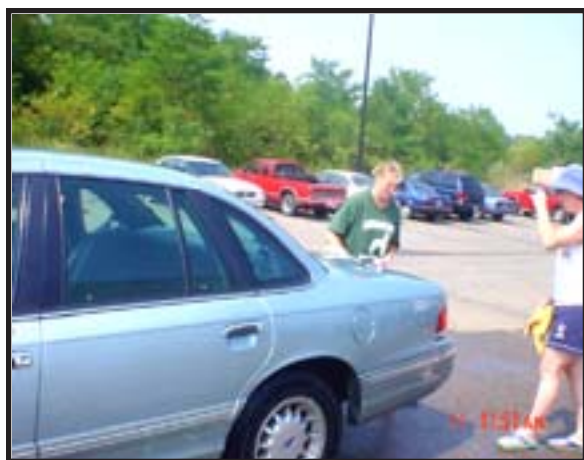
Car Wash, August 11, 2002