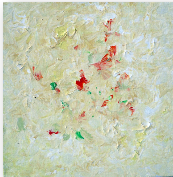
Budding Scarlet Paw-mpernel Flowers. Acrylic on canvas. 12x12", $100.

See Mozart's Mission Facebook page at facebook.com/MozartDane