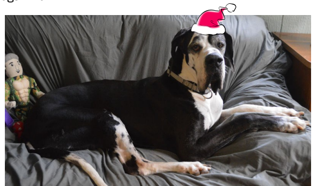
ODETTE is a mature lady who would love to snuggle with you on your couch!