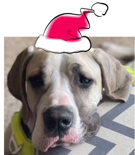
Kiki is now ready for adoption!

Her story: https://hhdane.com/danes/kiki.htm