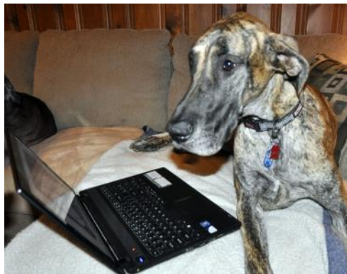
On the other hand, RIVA may have some misgivings... "Working from home has got to stop! My humans are driving me nuts!" Sounds like her family needs to check the list above.