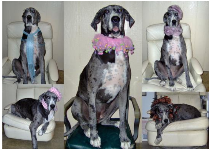
GRACIE (2003–2012) loved photo shoots—perhaps your dog will too!

Whatever you decide to do, enjoy this bonus time with your best fur friend!