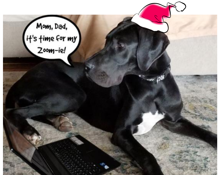
DARYL, HHGDR Sanctuary Dane, models virtual training.

dog's focus, and probably yours, is better, progress is quicker.