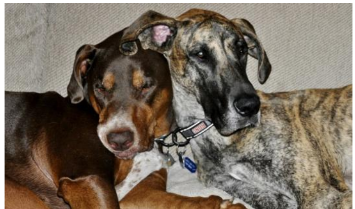
Adopted "siblings" NED and RIVA snuggle.

See more helpful articles on our site, including Bonding with Your Dog and Cost of Owning a Giant Breed Dog . And then check out our current adoptable dogs!