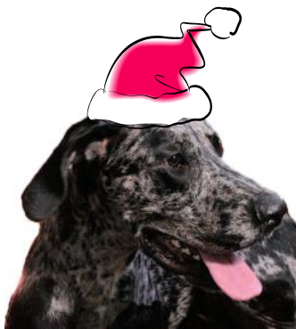
GABBY is now ready for adoption!

Please see page 2 for our toy wish list!