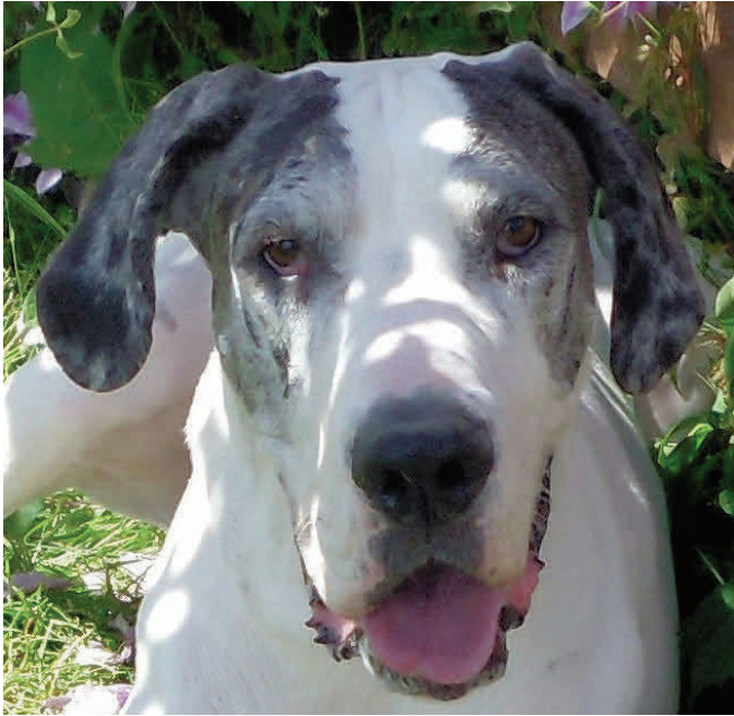
See TOBY's story at http://hhdane.org/danes/toby.htm .

Did you ever notice how some people have all the luck? No matter what they do in life they always come out on top. The same phenomenon pertains to dogs too. But, of course, for all the dogs that hit life's jackpot, there are ten times more—those of us that seem to have no luck!