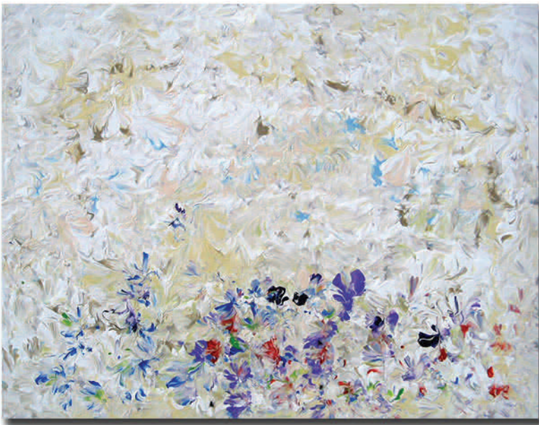
Mo-adow of Wildflowers by MOZART. 22" x 28" acrylic on canvas, $275.

MOZART has retired from painting and exhibiting at festivals but there are a few beautiful art works still available for purchase.