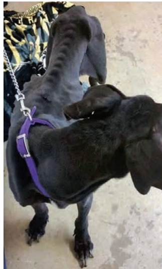
MARCI on February 23 at the Richland County Animal Shelter

pups have found better homes than I did. I have had so many homes, and although in some of them I was cared for (but why did they give me up?), I am trying to block out most of my earlier years because, just like my mom, I was bred over, and over, and over.