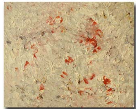
Shades of Paw-tumn by MOZART DANE. 16x20“, acrylic on canvas. $175.