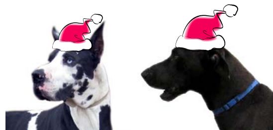
KINGSTON and LINCOLN, homeless Great Danes, say THANK YOU to every one of you who have helped the Rescue!

Thank you one and all, and if we have omitted anyone from our lists of donors and volunteers, we sincerely apologize.