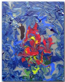
Azaleas at Mo-night by MOZART. 8 x 10”, acrylic on canvas.