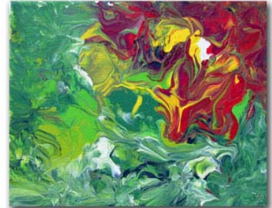
Modern Interpretation by MOZART. 8 x 10”, acrylic on canvas.