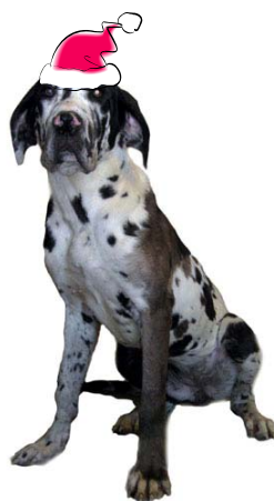
ZARA is a Mastiff. She would love a forever home!