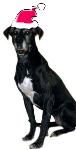
ZIVA is a Great-Dane looking for a home with a couch!