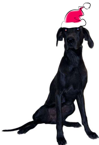
TANER is a young female Great Dane who loves to play!