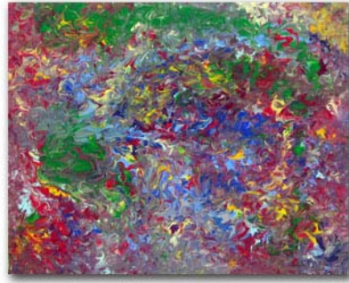
Am-paw Theater by MOZART. 24 x 30”, acrylic on canvas.