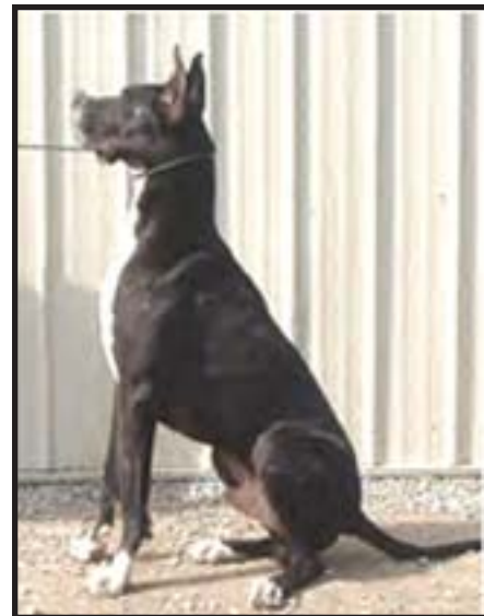
Guinness II - February 27, 2005

YOU CAN HELP FULFILL OUR MISSION WITH YOUR DONATIONS AND SPONSORSHIPS