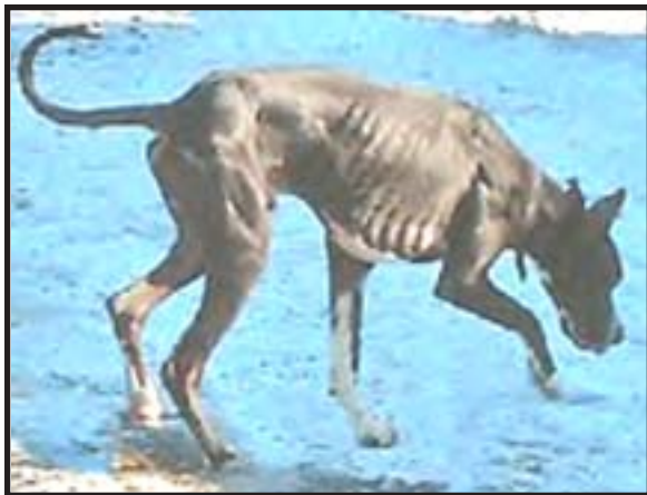
Guinness II - January 24, 2005

Now I am living inside a nice warm building with soft bedding to lie on. Best of all I know that there are people who care about me.